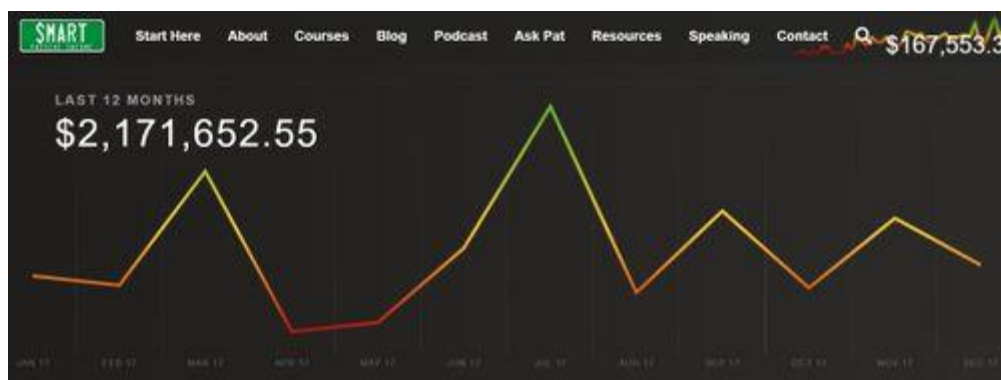
Pat Flynn's famous income report

For example, Pat Flynn , a successful affiliate marketer, is earning more than 2 million in 2017 . You can check out his income report here .